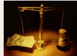
Developing Strategies That Impact Performance & Outcomes!

Our attitude demands that we impart a distinct impression making a positive impact in the experience of those we serve.