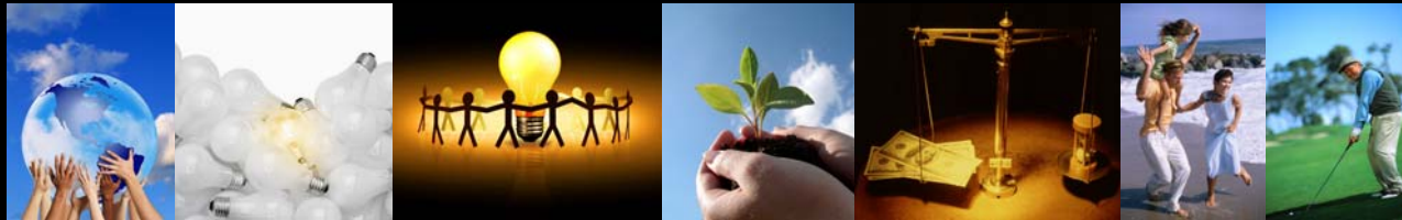
Leveraging Ideas & Solutions Hands-on Experts Profitability Balance Lifestyle Certainty